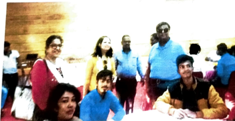
Figure-2 YI UTTARAYANA KITE FEST