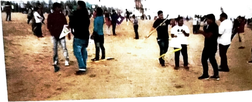
Figure-3 YI UTTARAYANA KITE FEST