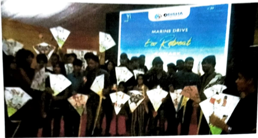
Figure-1, YI UTTARAYANA KITE FEST