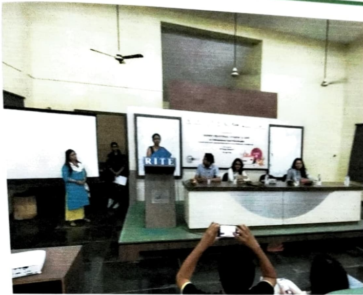
Figure-2 Date: 7.04.2022

EVENT Name: Awareness campaign: Women menstrual hygiene and care