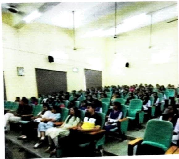
Figure-3, Date: 7.04.2022

EVENT Name: Awareness campaign: Women menstrual hygiene and care