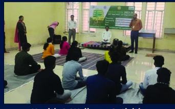
Health & Wellness Activities