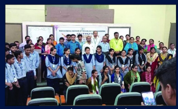
Seminar & Workshop