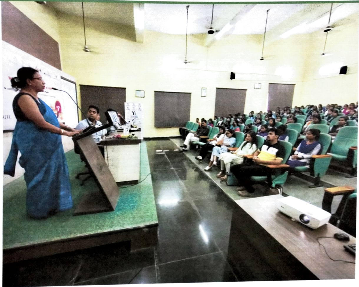
Figure-1, Awareness campaign: Talk on female hygiene and health.